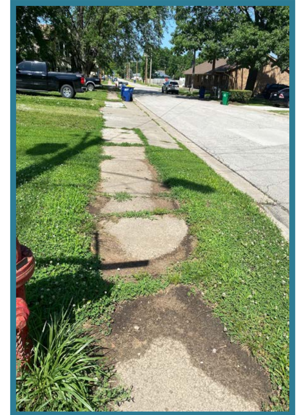
Examples of sidewalk conditions Downtown